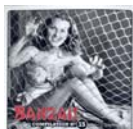
Banzai 15 (2006 Kamikaze Records)