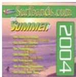
The Summer Of 2004 (2004 Surfware)