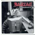
Banzai Sampler 10 (2003 Kamikaze Records)