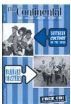
Continental 13 (2006 Double Crown)