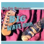
Big Wave Riders (2005 Deep Eddy Records)