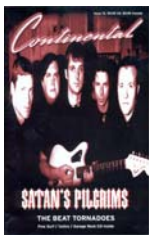
Continental 12 (2005 Double Crown)