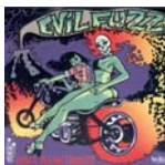
Evil Fuzz (Tribute to Davie Allan) (2005 Omom Records)