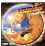
Krautsurf (2006 NPR Records)